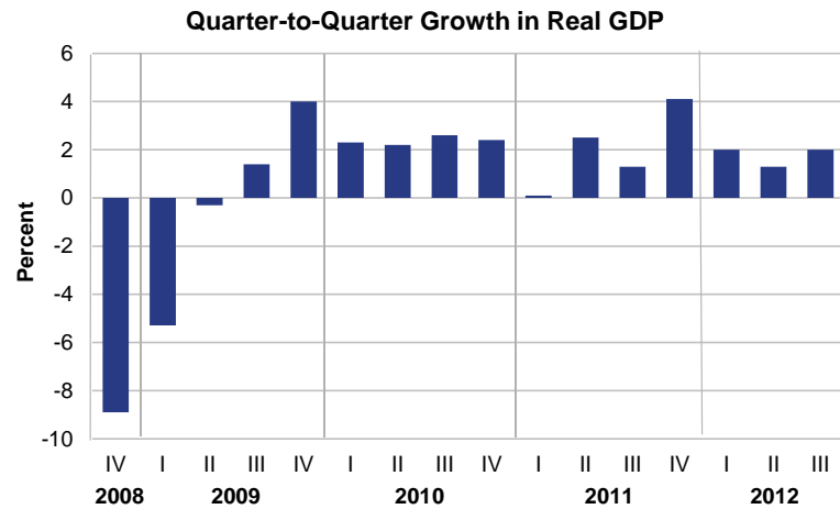
Real GDP growth is measured at seasonally adjusted annual rates.

Energy prices turned up, while food prices turned down. Prices less food and energy rose 1.3 percent in the third quarter after rising 1.4 percent in the second quarter.