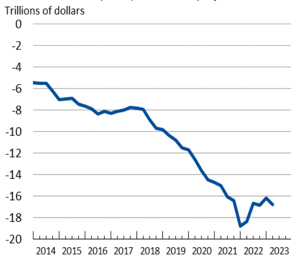
Chart 1. U.S. Net International Investment Position End of quarter, not seasonally adjusted

The U.S. net international investment position, the difference between U.S. residents' foreign financial assets and liabilities, was -\$16.75 trillion at the end of the first quarter of 2023, according to statistics released today by the U.S. Bureau of Economic Analysis (BEA). Assets totaled \$32.74 trillion, and liabilities were \$49.49 trillion. At the end of the fourth quarter of 2022, the net investment position was -\$16.17 trillion (revised).