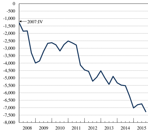
Chart 1. U.S. Net International Investment Position, 2007:IV-2015:III Billions of dollars (Quarterly, not seasonally adjusted)