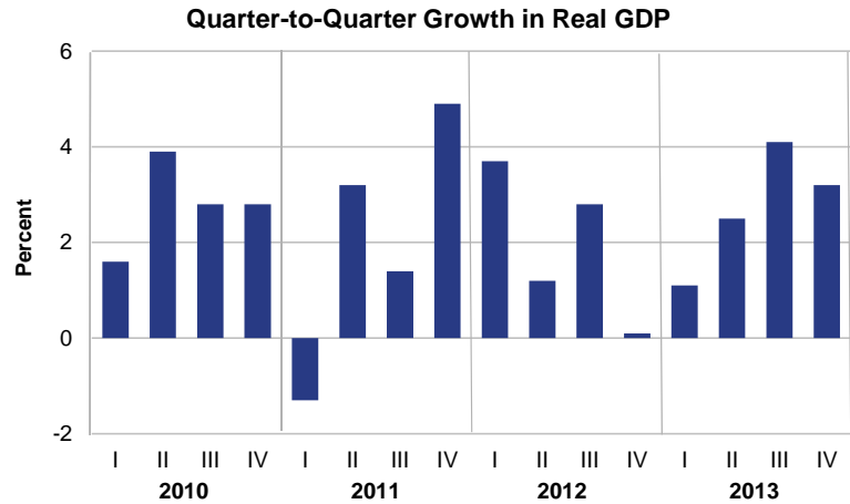
Real GDP growth is measured at seasonally adjusted annual rates

In contrast, state and local government spending declined less in 2013 than in 2012, and consumer spending on goods accelerated.