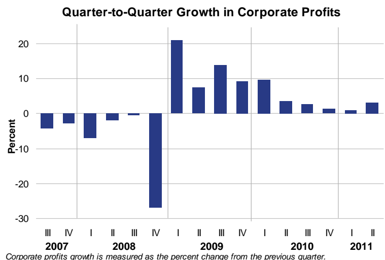
Corporate profits growth is measured as the percent change from the previous quarter.

Second-quarter nonfinancial profits rose 8.1 percent, while financial profits fell 11.5 percent from the first quarter. Profits from the rest of the world increased 8.4 percent.